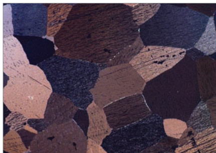
Zinc metal, reflected-light polarization Magnification: 100x